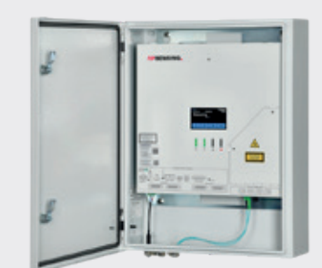
A4504A – cabinet IP66 – stainless steel