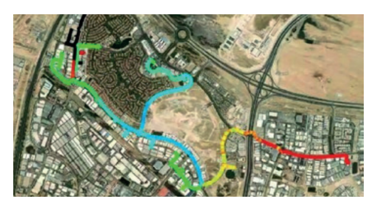
Thermal transients in real time

AP Sensing solutions are implemented in the most challenging and critical applications, protecting