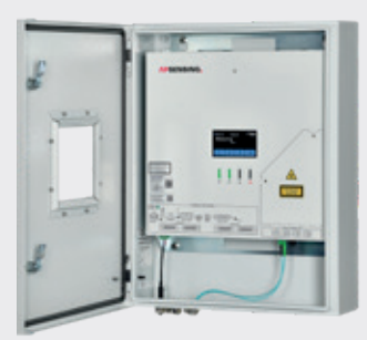
A4502A - cabinet IP66 isolated

A4500A – cabinet IP66 window Window required as per VdS