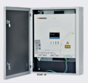
Selection of robust wall-mounted cabinets