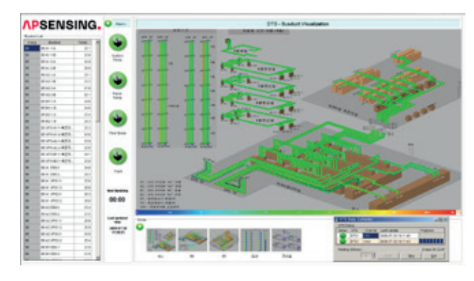
Visualization of bus duct temperatures

The AP Sensing fiber-optic temperature sensing solution alerts, identifies and locates every bus duct hot spot automatically in real time. It monitors the temperature and health of the entire bus duct continuously, every minute of the day. Our fiber-optic solution addresses challenges such as overcoming