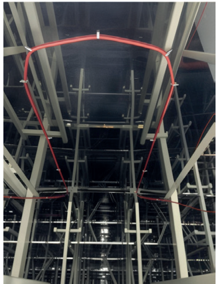
Optical fiber cable installation in the warehouse

The system passed the Final Acceptance Test (FAT) without any issues, and has been functioning properly since installation. A valuable infrastructure remains protected.