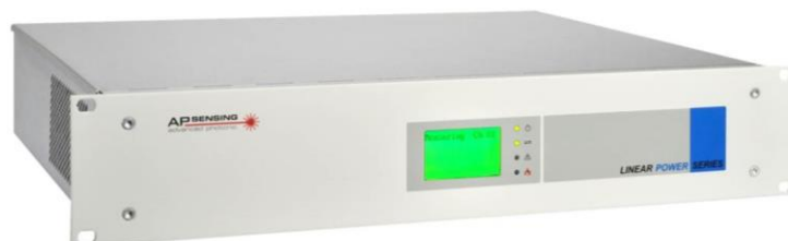
The AP Sensing Linear Power Series (Long Range Singlemode)

Training sessions were held for the operators to familiarize them with the software and alarming features. AP Sensing is proud to have been selected for this important infrastructure project. The installation was planned to be prepared for possible future expansions in terms of both distance and the number of channels. A very valuable infrastructure remains protected.