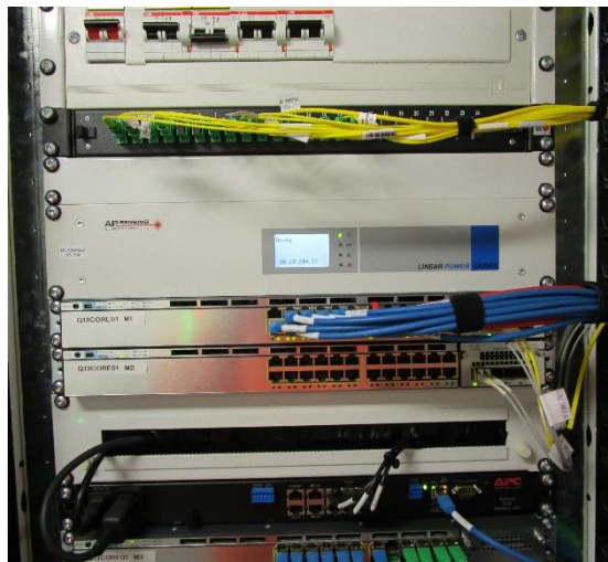
The AP Sensing Linear Power Series in a rack setup

The operators also selected the RTTR (Real Time Thermal Rating, also known as DCR for Dynamic Cable Rating) software . RTTR continuously calculates the conductor temperature, and also predicts the maximum permissible load for steady state and emergency situations. Based on the industry standards IEC 60287 and IEC 60853, it allows network operation at the highest possible safe ampacity levels .