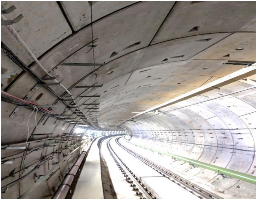
Metro tunnel and sensor cable

Currently utilizing 13 Distributed Temperature Sensing (DTS) devices, AP Sensing provides coverage in three different sections of the metro system: from Azadpur to Subhash Chandra Place and Naraina Vihar underground metro station, from Kalkaji to Vasant Vihar covering 10 underground metro stations, and Janak Puri to Palam and Indira Gandhi domestic airport underground metro station.