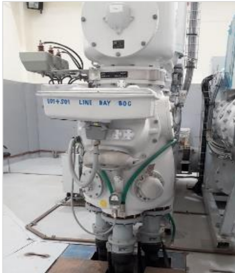
HV Cable Termination

The Distributed Temperature Sensing (DTS) system monitors the HV power cable continuously, generating a constant data flow of temperature traces. 15 alarm zones are defined to generate pre-alarms at 65°C and alarms at 75°C anywhere along the 1.3 km of power cable. Special zones are also established for joint bays and facility crossings, such as roads and LNG pipelines. A Rogowski coil with a 4-20mA transducer is used for current load measurement, which is required for RTTR computation. An alarm hooter is connected with the DTS opto-coupled relays in order to trigger when alarm thresholds are reached.