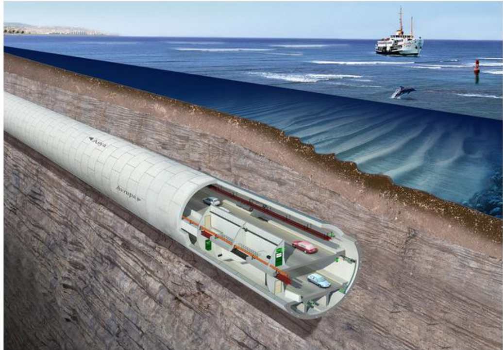
Tunnel cross section

The fiber-optic sensor cable selected has an FRNC outer sheath, which is installed along the tunnel ceiling. The robust AP Sensing “Steel” and “Safety” cables were selected for their fast response times and durable construction.