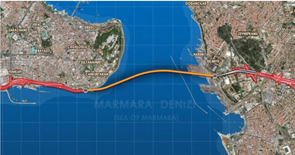
Tunnel route crossing the Bosphorus strait