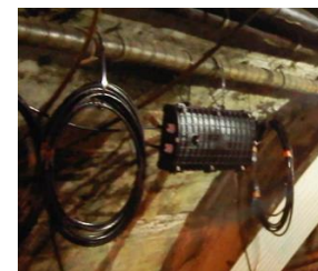
Splice box and ambient temperature measurement coil