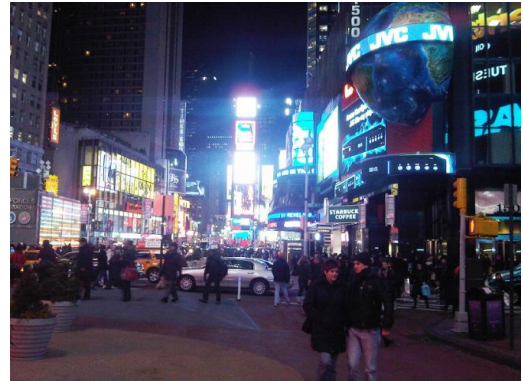
Times Square, New York City

Underground utilities are “the power” beneath large cities. They feed the metropolises with electric power, gas and water. Failures in this sensitive infrastructure are costly and therefore USI Power selected AP Sensing’s outdoor DTS instrument to permanently monitor the temperature along a 220kV power circuit connecting Manhattan (East Harlem) to Queens .