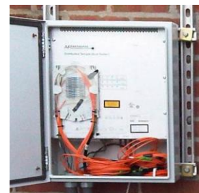
IP66 outdoor housing