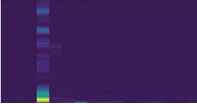
Frequencies present at cable fault in case 1