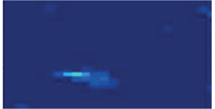
Result from thumper test in case 3

identified. To determine the location, thumper tests were carried out on the cable. These tests use high voltage pulses, either giving single or multiple shots to the cable. The below image is a result from one of the thumper tests. It creates a signal in the cable fault location, which could be captured by the DAS system as shown in the image. The location of the fault corresponds to the highest peak signal at the location 9.165 m.