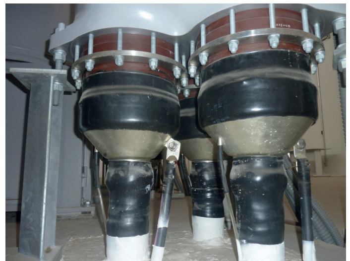
Figure 3: GIS Termination showing the three phases