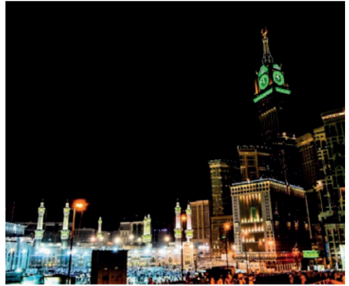
Mecca at night

The crescent is 23 m high and weighs some 35 tons, with a complex series of lighting inside. It is made of fiberglass-backed mosaic gold. The massive loudspeakers and their power supply are located in the minaret base and emit calls to Prayer that can be heard 7 km away. Some 21,000 lamps illuminate the base, which can be seen 30 km away.