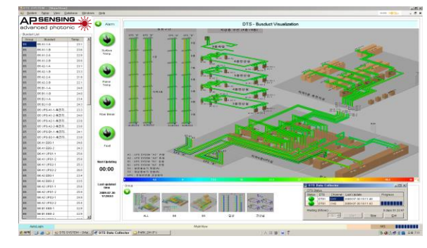
Visualization of bus duct temperatures

It monitors the temperature and health of the entire bus duct continuously, every minute of the day. Our fiber-optic solution addresses challenges such as overcoming the requirement of physical access after a bus duct is energized. In addition, it provides reliable and intelligent alarm alerting to the facility manager before any possible occurrence of disruptive incidents.